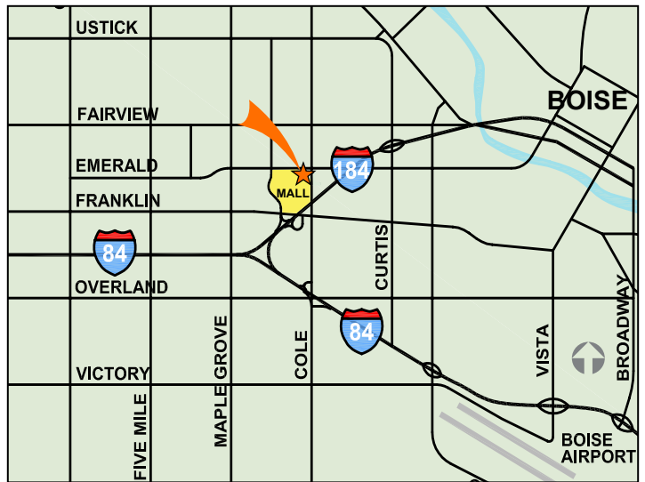
★ Property Location - 7447 W Emerald St, Boise